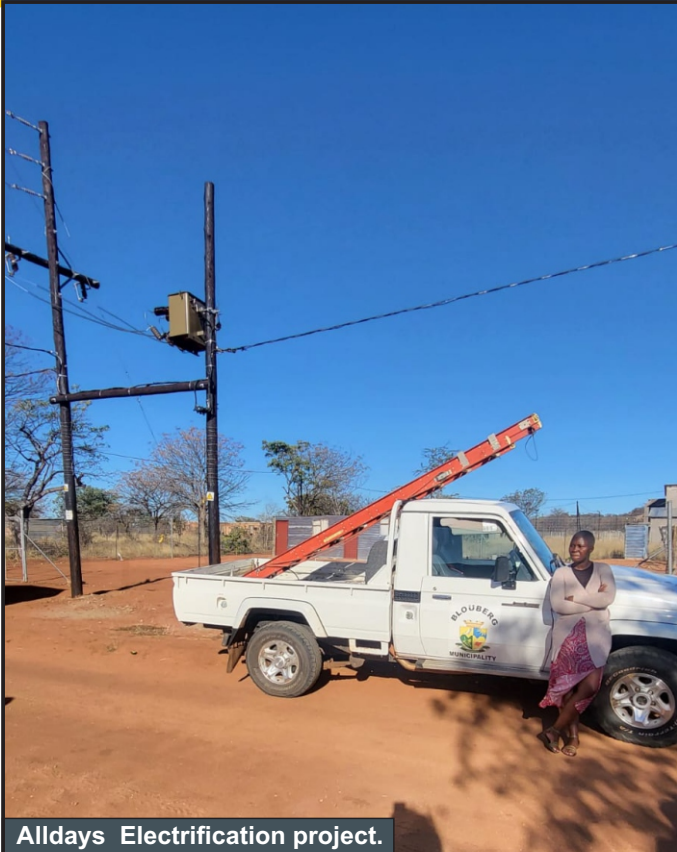
Alldays Electrification project.