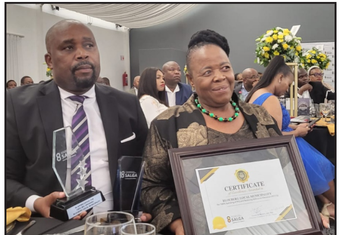
Blouberg Local Municipality recognized by SALGA for achieving an Unqualified Audit opinion, 100% MIG Spending and Receiving Additional Allocation for 2021/2022 Financial Year.