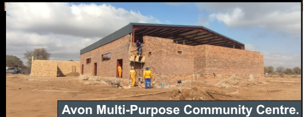
Avon Multi-Purpose Community Centre.