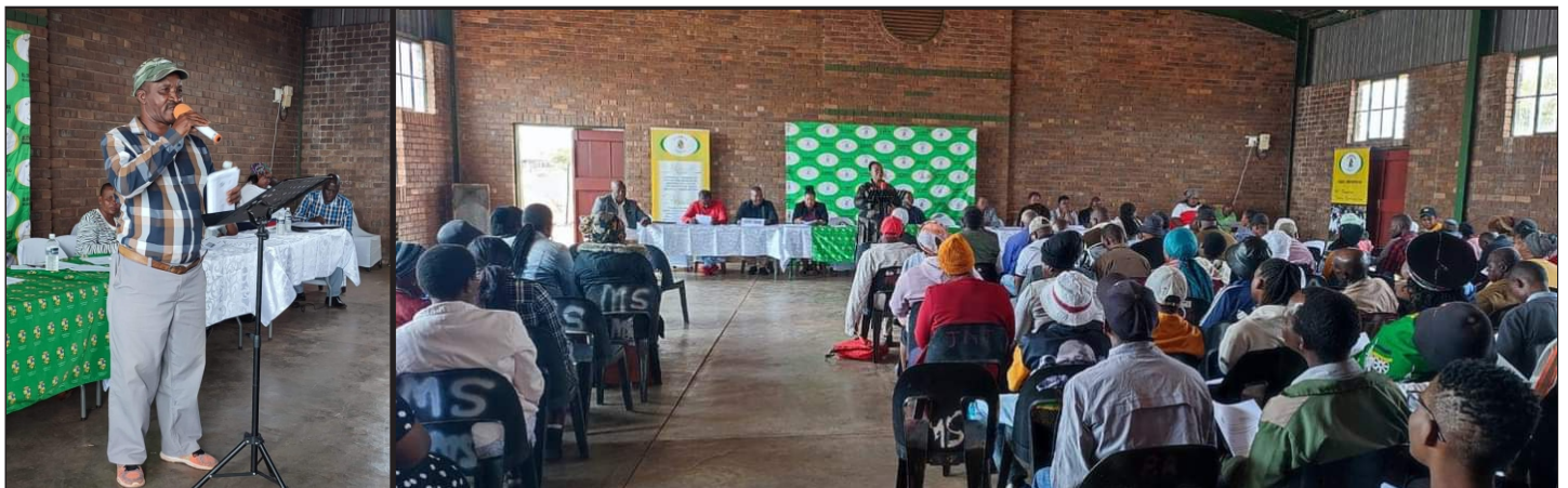
Community members commenting on the draft IDP/Budget

The IDP takes into account the existing conditions, problems and resources available for development. The plan looks at economic and social development for the Blouberg area as a whole. The IDP also set a framework for how land should be used and what infrastructure and services are needed among other things. Mayor Thamaga on May 29, 2023 presented the final IDP and budget for implementation from July 1, 2023.